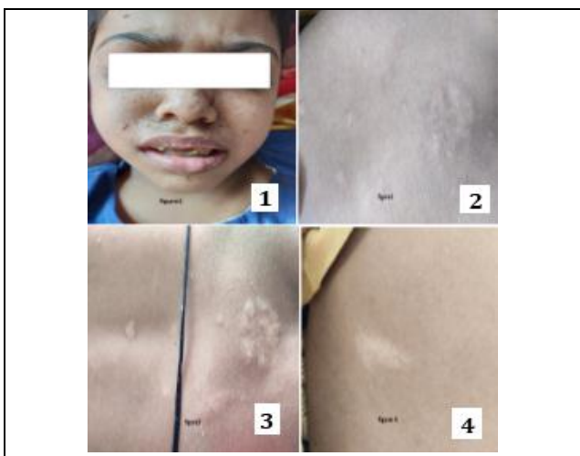
Figure 1. Clinical Photographs of Patient Showing Adenoma Sebaceum, Figure 2,3. Shagreen Patches, Figure 4. Ash Leaf Macule

On general physical examination, multiple well defined, brownish sessile nodular growths were noted over the forehead, nasal folds, nose and cheeks in a "butterfly pattern" suggestive of adenoma sebaceum [figure 1]. Over lumbo-sacral area multiple raised hypermelanotic skin patches were noted characteristically suggestive of shagreen patch [figures 2, 3]. Multiple hypomelanotic patches with characteristically fish tailing appearance were found over median part of right thigh, abdomen, and largest one of approximately 5x5 cm 2 over right buttock [figures 4-7]. Vitals signs were found to be within satisfactory limits.