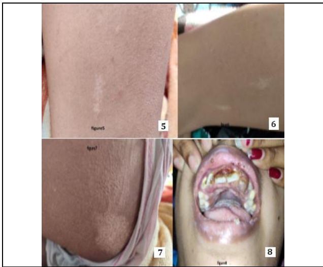
Figure 5-7. Ash Leaf Macules Over Leg, Thigh and Gluteal Region, Figure 8. Intraoral Angiofibroma

On intraoral examination, similar well defined, sessile,